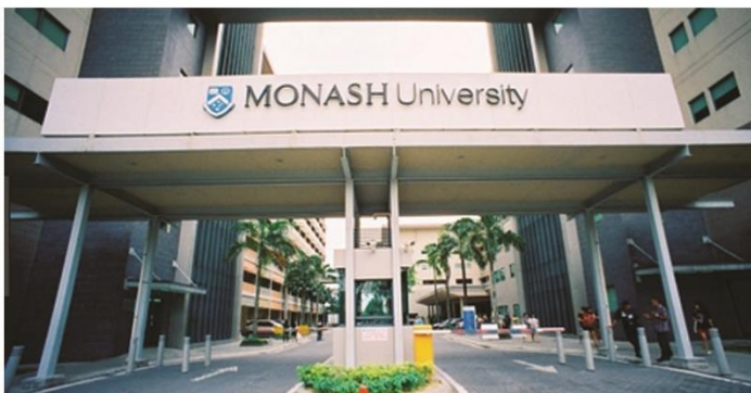
Monash University will host the 34th MSPP Scientific Meeting in 2020.