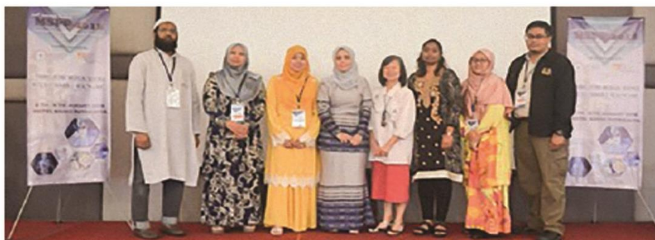
The newly elected Society EXCO members for 2018-2019 after the Annual General Meeting during the Society's 32nd Scientific Meeting