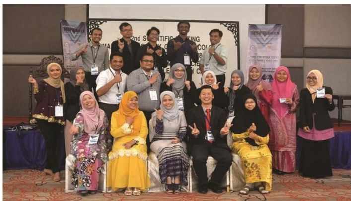
Some of the committee members who organized the 32nd MSPP Scientific Meeting.